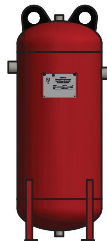
MODELS VR14-36 – VR18-60

For translations of this fact sheet, go to our website or scan the QR code.